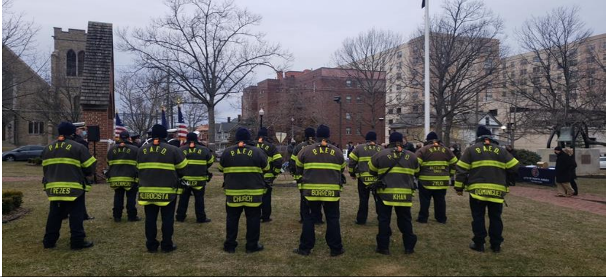
Members of the Department @ the Covid 19 Victim Memorial Program in March