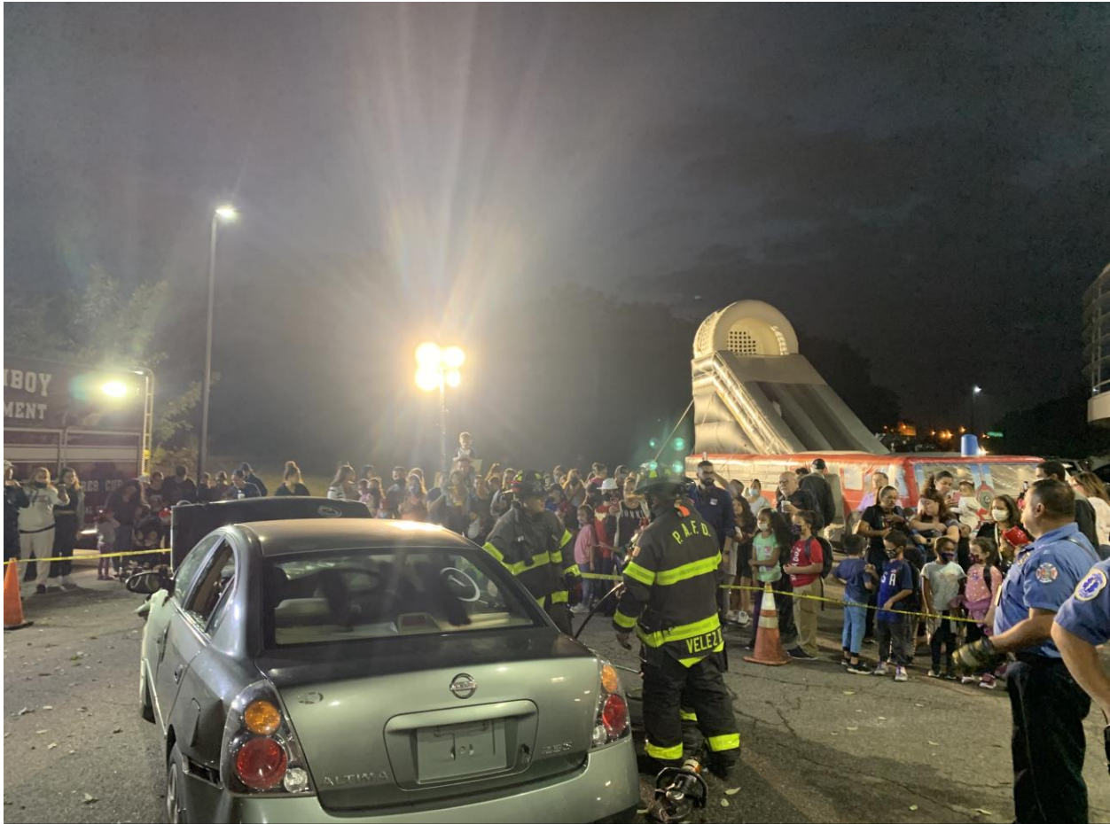
Members of the PAFD doing an extrication demo at the Open House

On October 8, 2021 the Fire Department held its annual Fire Prevention Open House. Several hundred City residents attended this free event at fire headquarters. Members of Special Operations performed an extrication demo, Sparky walked around and took selfies with everyone, the Middlesex County Fire Academy showed a sprinkler/live fire demonstration, kids were able to slide down a fire truck inflatable slide and sit in all of our fire apparatus and members of the fire department were able to teach about fire safety and how to reduce fires at home.