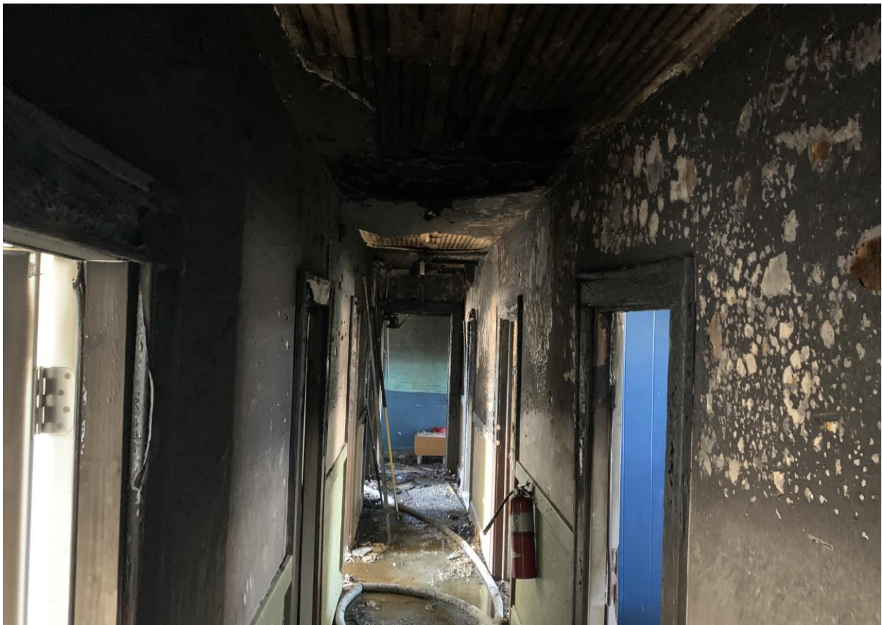
Members of the Fire Investigation Unit (FIU) conducting Origin & Cause Investigations

The Perth Amboy Fire Department continues to investigate all fires in accordance with the New Jersey Uniform Fire Code under the direction of the Fire Chief and Fire Official. The Fire Investigation Unit works diligently for hours after a fire is extinguished and sometimes for days after to best determine the origin and cause of a fire. They are able to assist the property owners and their insurance companies so that they can rebuild and bring their lives back to normal as quickly as possible. All suspicious fires are investigated by the Fire Investigation Unit in conjunction with the Perth Amboy Police Department. Members of the Fire Investigation Unit all complete annual training and are all State or Nationally Certified Fire & Arson Investigators.