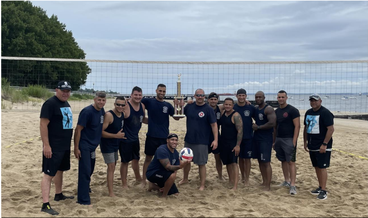
PAFD wins the First Responders vs Healthcare Workers Volleyball Tournament

In 2021, the Department participated in several first responder and healthcare worker sport tournaments. While the PAFD won the First Annual Thomas Shanahan Memorial First Responders vs Healthcare Workers volleyball tournament, we did not win the dodgeball tournament.