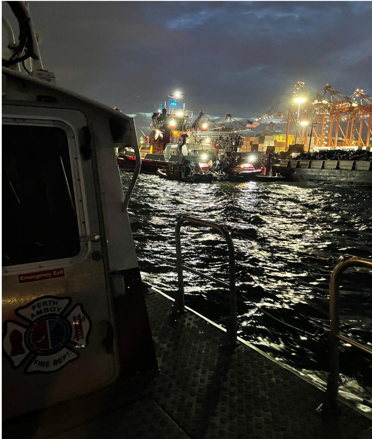
Marine 5 operating with FDNY Marine 9 at a Fire in Port Newark

Edgewater. The Task Force is supported by the FDNY and United States Coast Guard as well. The main purpose of this Task Force is to have an organized marine response to all incidents within the Port of New York and New Jersey, which begins in Perth Amboy.