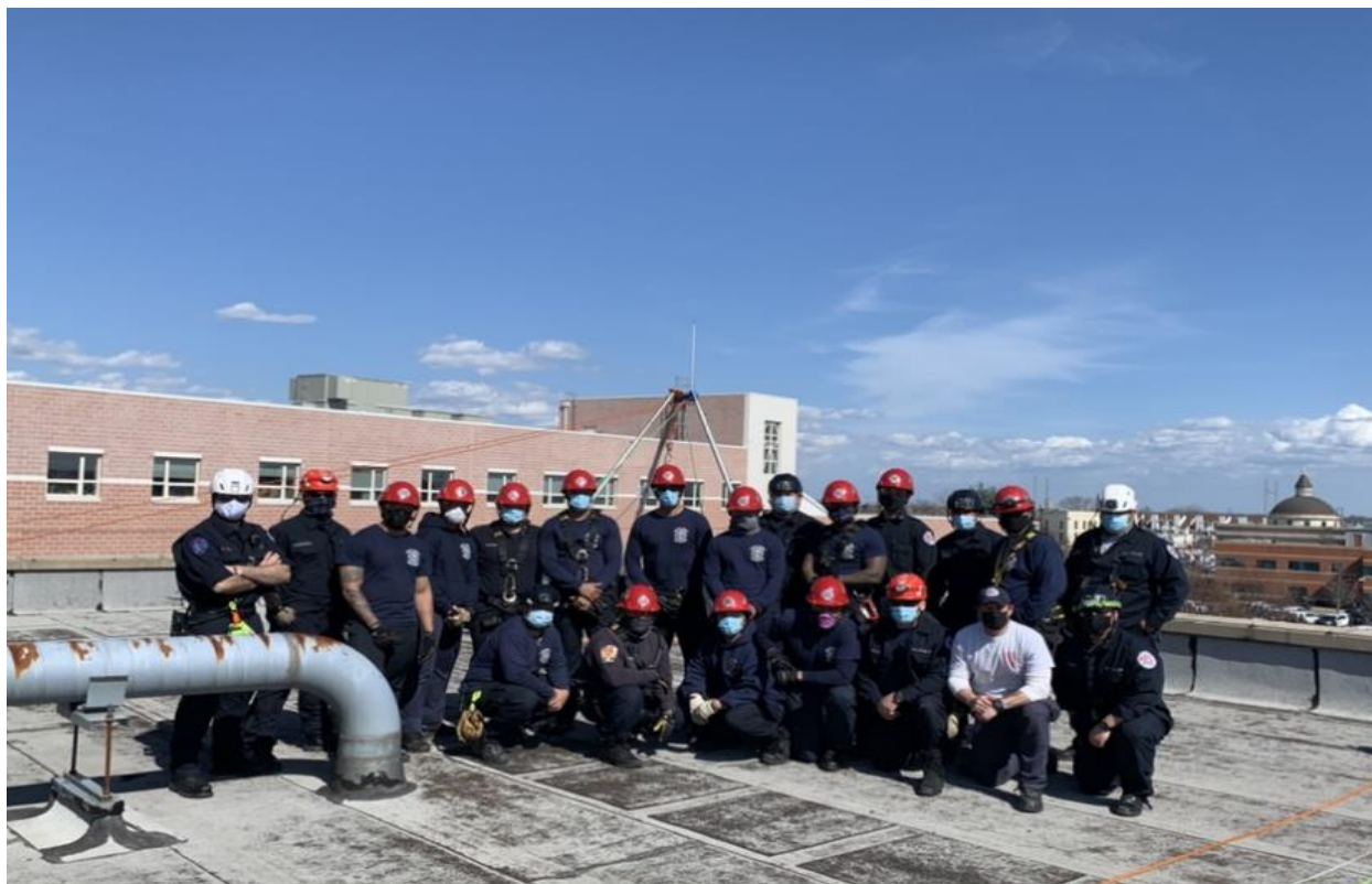
Members of the Special Operations Team Conducting High Angle Rope Rescue Training

responded to mutual aid calls for various rescue incidents. In 2022, the Special Operations Team Operations Team will be purchasing a collapse rescue trailer that will have all of the wood necessary on wheels for trench rescues and building collapse incidents. This will be towed with a new Car 10 which is set to be ordered in March 2022. Also in 2021, five new members of the department were added to the team.