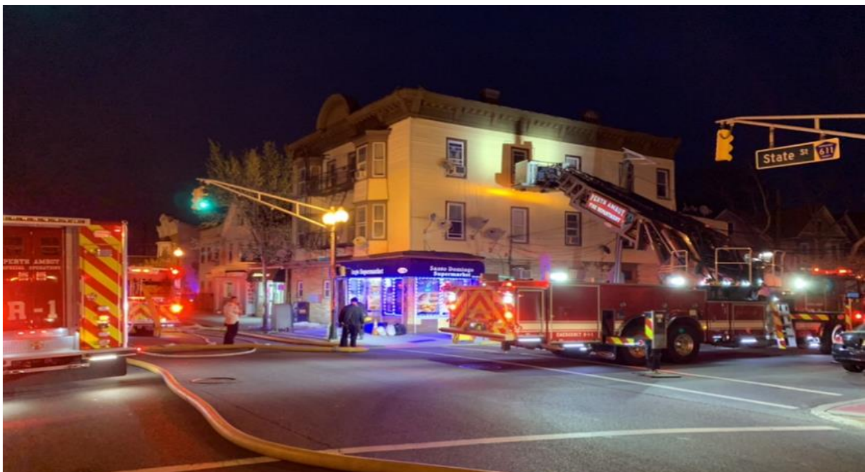
All Hands Fire @ 518-520 State Street

2021 was a very busy and productive year for the Perth Amboy Fire Department. The PAFD responded to 2,232 emergency incidents including 183 fires of which 10 were a multiple alarm fire. The Fire Prevention Bureau conducted a record setting 4,578 fire inspections. The Training Division completed over 7,000 hours of firefighter training. FEMA awarded a Port Security Grant for the maintenance of Marine 5 and for the purchase of additional SCUBA dive equipment. As in the past years, millions and millions of dollars in taxpayer property was saved through the hard work of the fire department and civilian lives were saved. The Perth Amboy Fire Department remains ready, staffed, trained and equipped for any type of emergency 24/7 365 days a year.