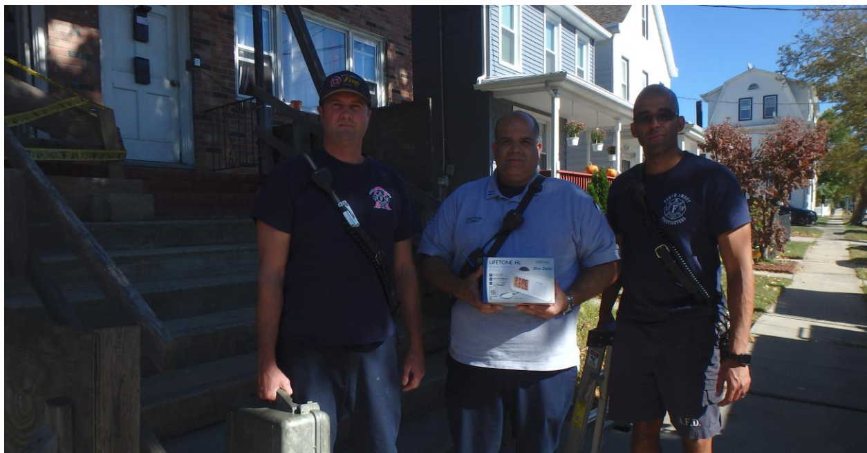
Members installing a bed-shaking smoke alarm for a hearing impaired resident