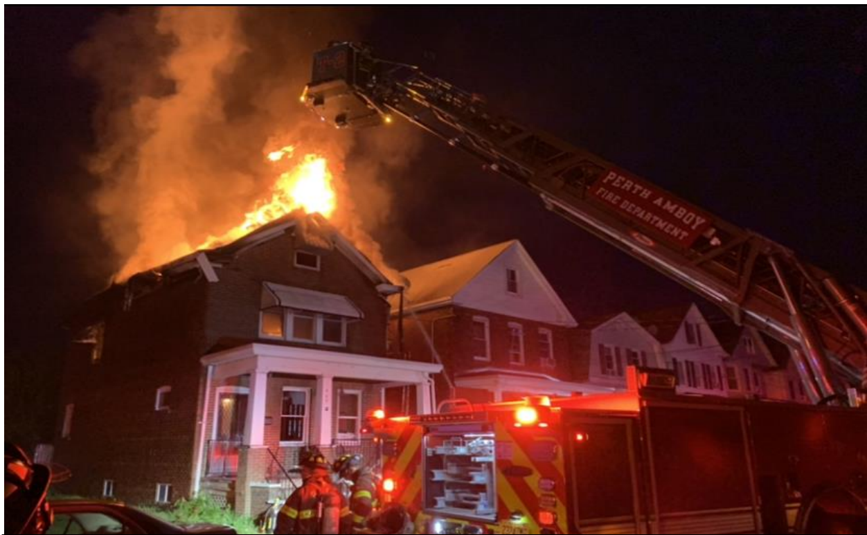
Second Alarm Fire @ 409 Brace Avenue with Victim Rescued on 6/02/2021

with water rescue suits and our inflatable zodiac boat. Here they rescued occupants that were trapped in waters over 8' deep and operated over 5 hours to ensure no lives were lost.