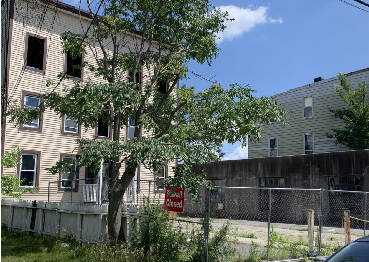
The future location of the Perth Amboy Fire Department's Memorial Station 2

In 2022 the Fire Prevention Bureau will conduct over 5,000 fire inspections and complete the purchase of its entire fleet of fire inspector vehicles. The Bureau also plans on purchasing $10,000 worth of carbon monoxide alarms to install free of charge to 1 and 2 family owner occupied buildings that do not have them. The Bureau also plans on purchasing a fire extinguisher training prop that will be taken to community events to show the public how to properly use a fire extinguisher.