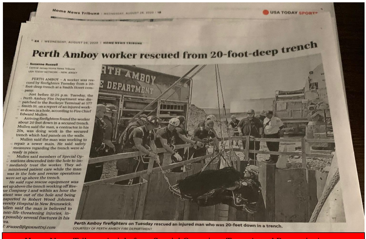
Home News Tribune Article from Special Operations Team Actual Rescue in August

The Special Operations Division continues to train monthly in the fields of water rescue, ice rescue, confined space rescue, high angle rope rescue, motor vehicle extrication, trench rescue, building collapse rescue and man vs machine type rescues. In 2020, training had to be reduced as the Covid 19 pandemic put restrictions on the amount of people that could gather at a time. The Team was still able to advance their training in all areas as the Department added Rescue Company 1 in service. Members of Special Operations Team staff Rescue 1 24/7, providing the team with all of their equipment in service on a frontline apparatus. Multiple rescues were made in 2020 utilizing the apparatus as a high anchor point, as it was designed to do, facilitating in the rescue of injured people. Not only with this protect the City of Perth Amboy, but it will be able to respond to all of the surrounding communities as the technical rescue unit. The Special Operations Team will also train all new hires in an 80 hour technical rescue class in 2021.