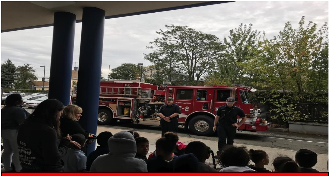
Members of the Department Educating the Children During Fire Prevention Week

The Fire Department partners with organizations both in the public and private sectors. Some of our public sector partnerships are with our own police and recreation departments. Some of the events we have assisted in were the national night out celebration, walk your child to school day, family fun day, the team tsunami swim meet, bring your child to work day, the trunk or treat event at the waterfront and many more. Additionally, the fire department made a visit to every school, and many of the day care facilities to teach about fire safety during our "Fire Prevention Month."