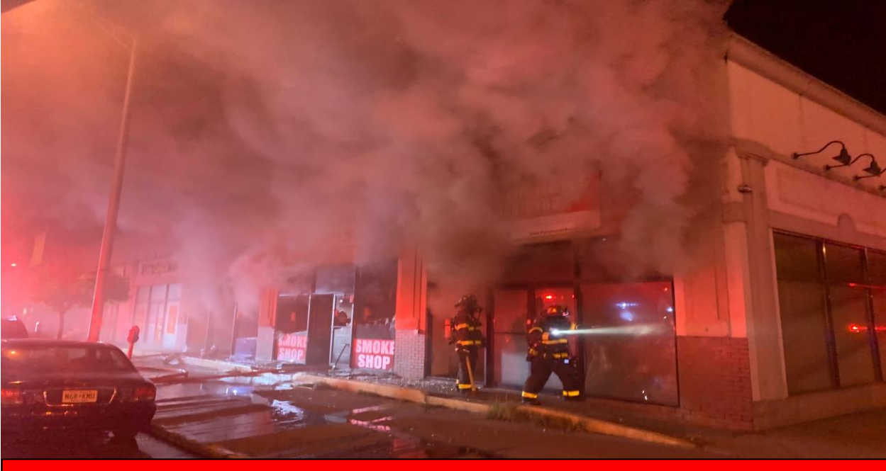
Building Fire on October 27, 2019 at 337-347 Madison Aveune