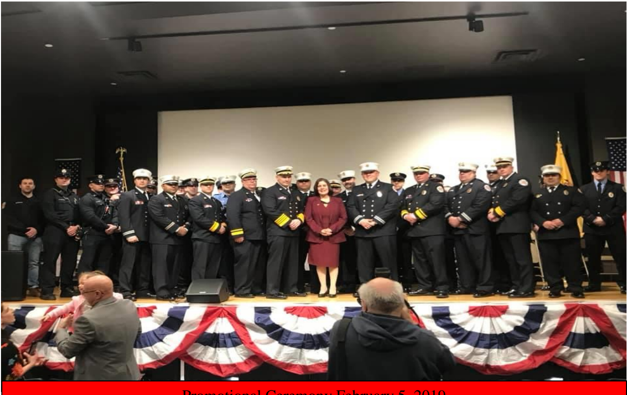
Promotional Ceremony February 5, 2019