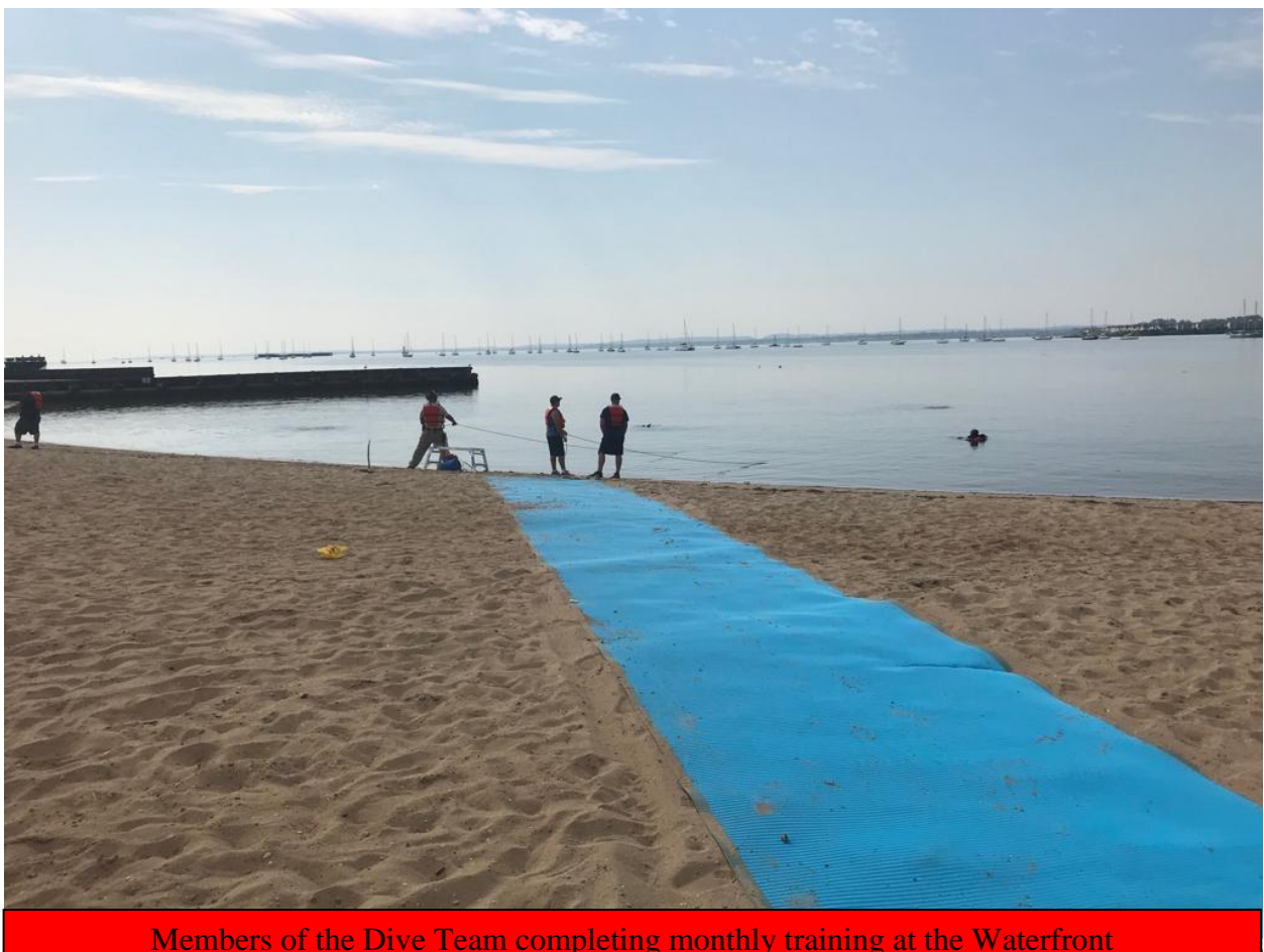
Members of the Dive Team completing monthly training at the water

The Dive Team became fully functional and able to respond to emergencies on October 1, 2019. This Team was funded by the Port Security Grant Program in 2017. In total, 28 members now make up the team. 12 firefighters and 4 police officers are trained to the SCUBA Rescue Certification and 12 firefighters were trained to the dive tender level. Since its inception, the Dive Team has completed 3,248 hours of training in the past three years. Moving forward, it is expected that the Dive Team will be called to any Dive Emergencies throughout the County if needed as there are no other formal teams within the County.