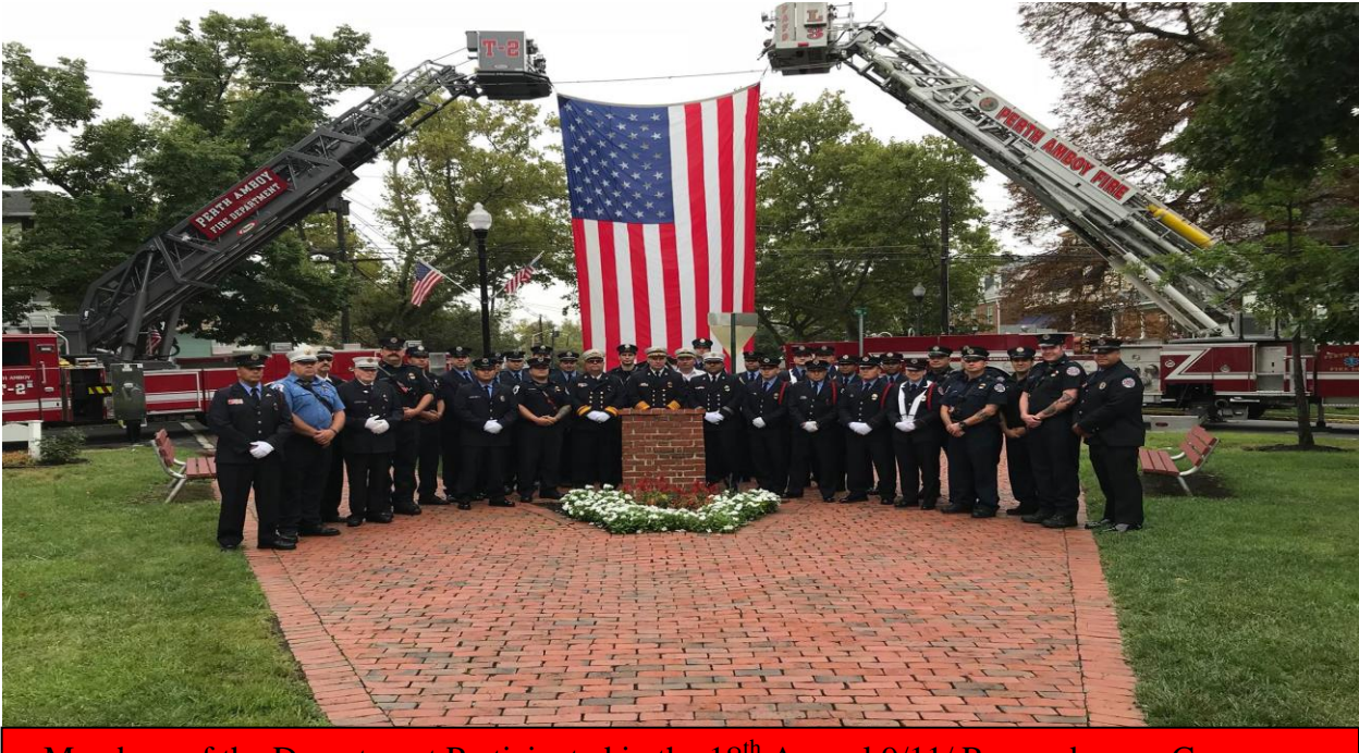
Members of the Department Participated in the 18th Annual 9/11/ Remembrance Ceremony

antique fire truck, maintain & organize the museum and give any tours for the public. The Volunteer Division also greatly helped out with the City's Code Blue throughout the winter. Here members assisted the homeless at the Community Center stay warm on the coldest nights of the year. The volunteer division is where a majority of the career firefighters in the department began their fire service career.